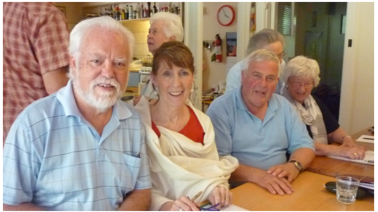
The East-West Meditation Foundation Meeting at KARITH, Warburton, Vic.

During the month of December the regular schedule for Centring prayer, Lectio Divina and Merton Bridges programs, continued. Some new people attended, and the groups are looking forward to continue in the New Year.